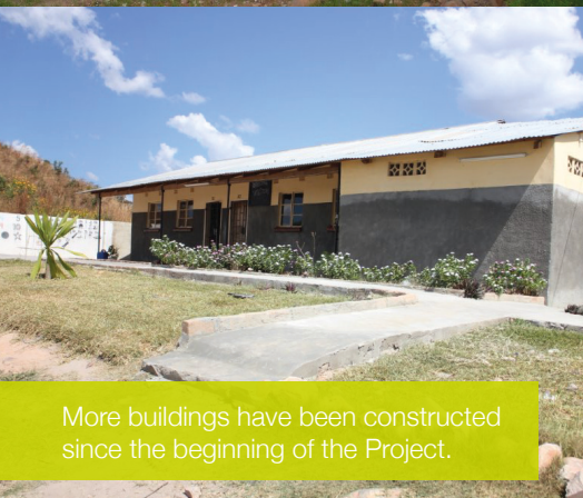
More buildings have been constructed since the beginning of the Project.