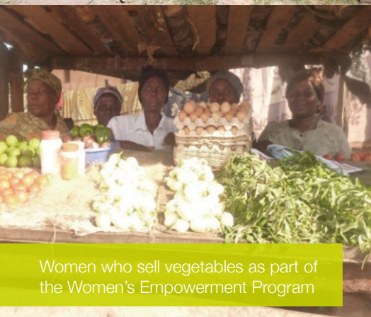
Women who sell vegetables as part of the Women's Empowerment Program